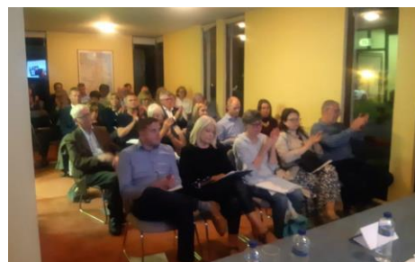
Meeting of Elected Representatives organised by St John of God Community Services

The National Federation's Pre Budget and General Election Campaign has been very active throughout the summer months and in the run up to the Budget. Following the development of evidence-based messages illustrating the crisis in disability funding and supports, and its presentation to the Joint Oireachtas Committee on Health, member organisations met at a General Meeting in August 2019 to agree a strategy for local and national engagement across the political system. A set of agreed short messages was devised and these can be accessed on our website at the following link: